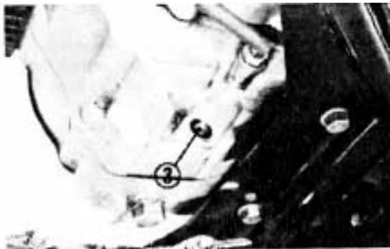
(3) Tensioner bolt