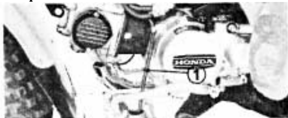
(1) Carburetor drain tube