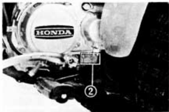
(2) Engine serial number