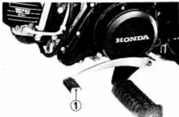
(1) Gearshift pedal

Depress the pedal to up shift to a higher gear and raise the pedal to downshift.