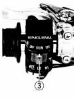
(3) Engine stop switch