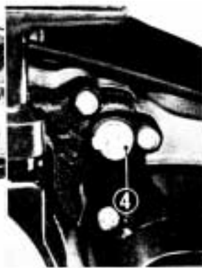
(4) Neutral indicator