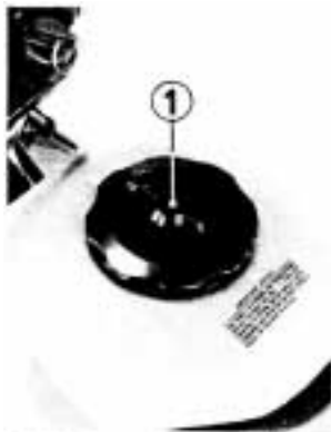
(1) Vent lever