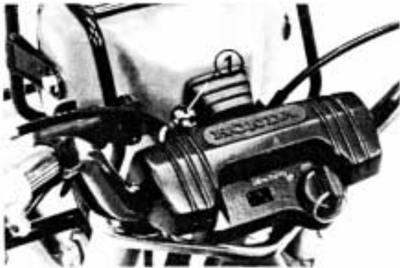
(1) Choke knob

To restart a warm engine, it is not necessary to use the choke.