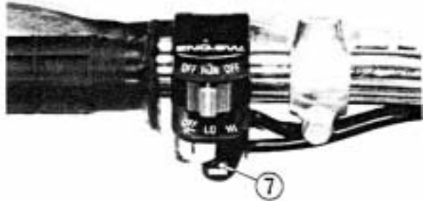
(7) Starter button