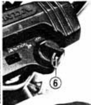
(6) Ignition switch