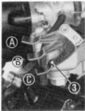
(3) Choke lever