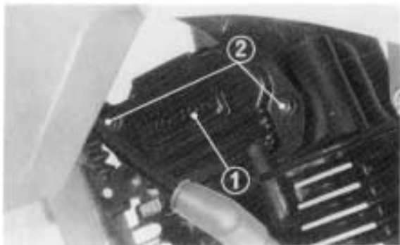
(1) Valve adjuster cover (2) Bolts