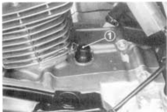
(1) Rubber cap