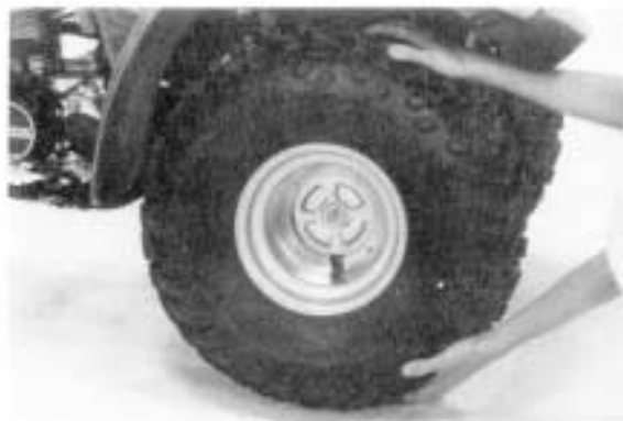
(1) Wheel nuts