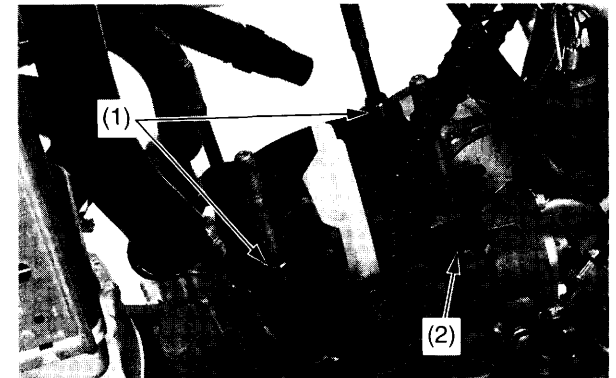
(1) dowel pins (2) cylinder head gasket

Do not let the dowel pins fall into the crankcase.