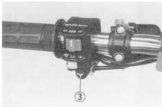
(3) Starter button