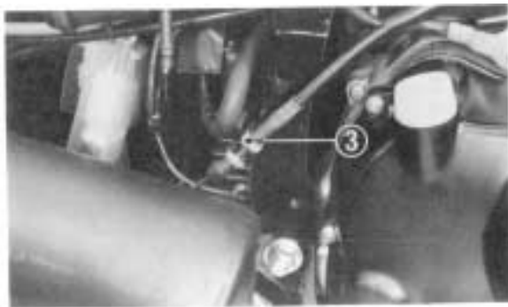
(3) Lower adjuster

Make sure the brake arm, and fasteners are in good conditions.