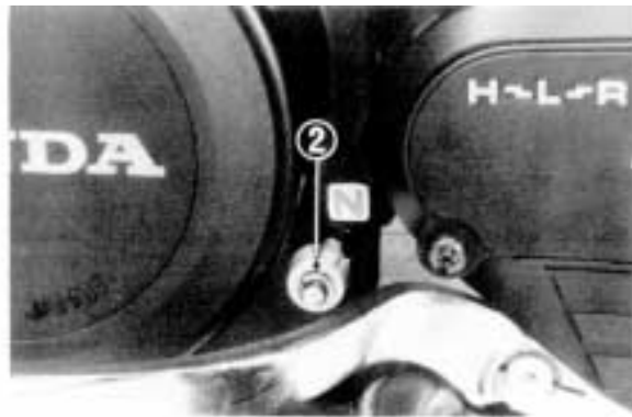
(2) Neutral indicator

The neutral indicator (2) is on the left crankcase cover, just behind the recoil starter. The indicator rotates as the gears are changed. When the indicator aligns with the N mark on the crankcase, the transmission is in neutral.