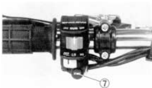
(7) Starter button