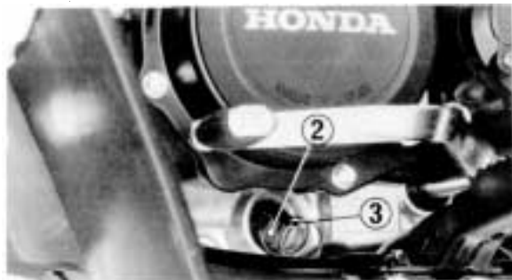
(2) Oil filter screen (3) Spring