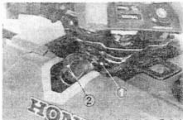
(1) Steering lock (2) Ignition key