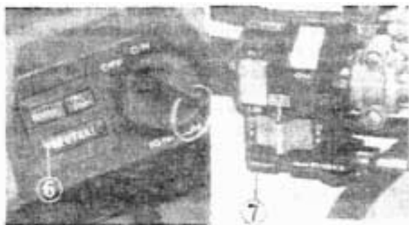
(6) Neutral indicator lamp (7) Starter button