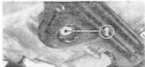
(1) Oil drain plug

the rubber on oil filter facing out and install the cover using the screws. Tighten the screws securely.