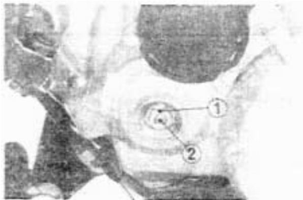
(1) Lock nut