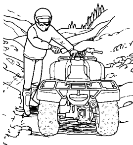
Be sure your legs are clear of the wheels.

If the hill is not too steep and you have good footing, you may be able to walk the ATV back down the hill. Make sure your intended path is clear in case you lose control of the ATV.