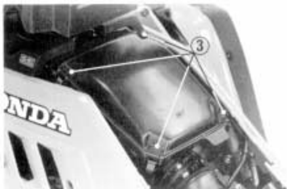
(3) Retainer clips