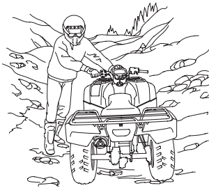
Be sure your legs are clear of the wheels.

If the hill is not too steep and you have good footing, you may be able to walk the ATV back down the hill. Make sure your intended path is clear in case you lose control of the ATV.