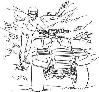
Be sure your legs are clear of the wheels.

If the hill is not too steep and you have good footing, you may be able to walk the ATV back down the hill. Make sure your intended path is clear in case you lose control of the ATV.