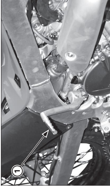
(1) KICKSTARTER PEDAL

When filling the coolant system, be sure to bleed air completely. If not, the system cannot be sufficiently filled and will cause overheating.