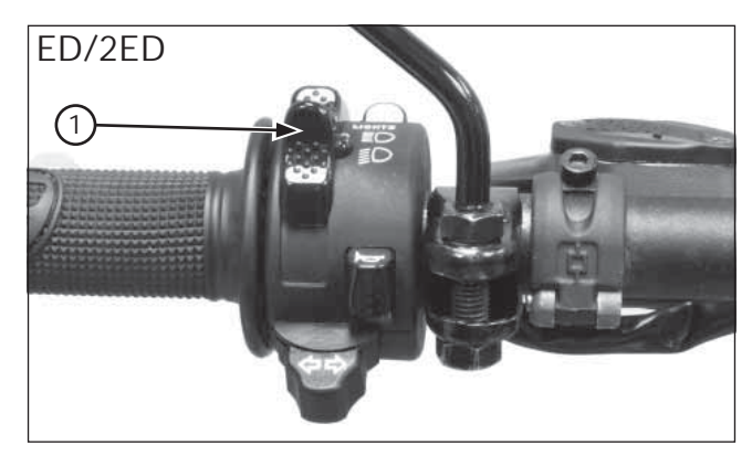
(1) HEADLIGHT DIMMER SWITCH