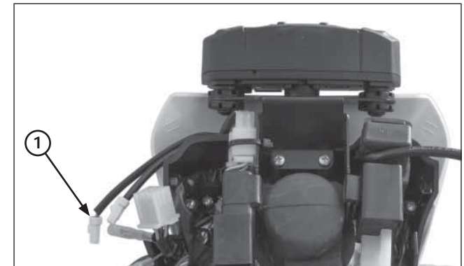
(1) 2P (WHITE) CONNECTOR