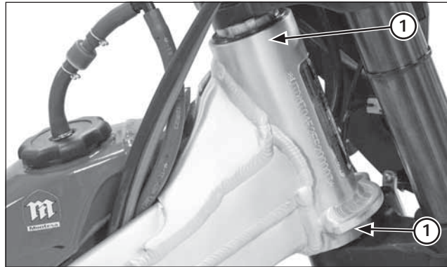
(1) STEERING HEAD BEARINGS