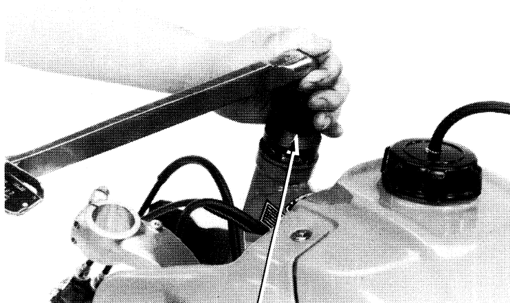
STEERING STEM SOCKET 07916–3710100

TORQUE: 36–38 N·m (3.6–3.8 kg·m, 26–28 ft·lb)