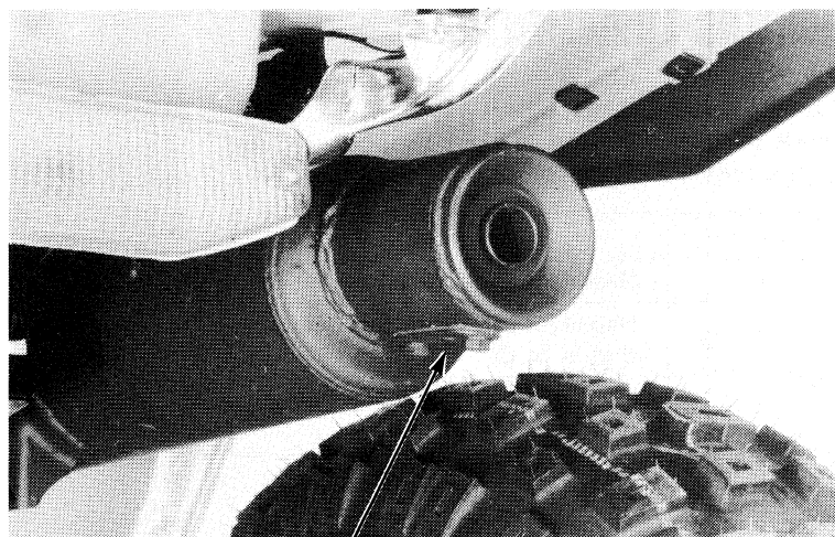
DRAIN HOLE COVER

Remove the drain hole cover. Start the engine with the transmission in neutral, and purge accumulated carbon from the spark arrester system by momentarily revving the engine several times. Stop the engine and allow the exhaust system to cool. Install the drain hole cover.