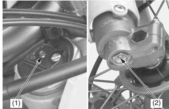
(1) compression damping adjuster (2) rebound damping adjuster