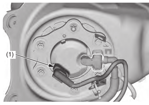
(1) fuel pump connector

3. Reposition the fuel tank and start the engine and let it idle until the engine stalls.