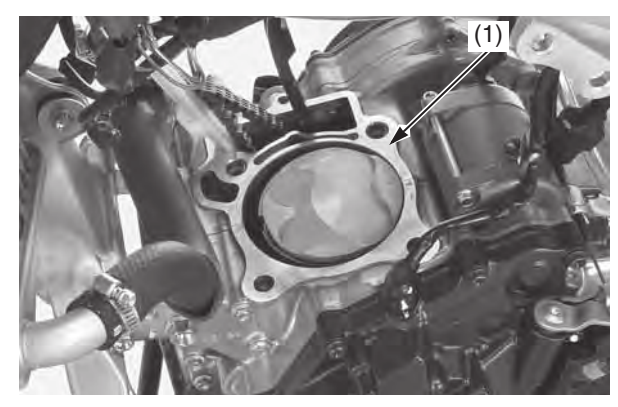
(1) crankcase mating surface

1. Clean the cylinder mating surfaces (1) of the crankcase, being careful not to let any material fall into the crankcase.