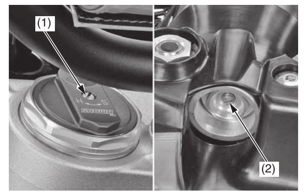
(1) compression damping adjuster(2) rebound damping adjuster