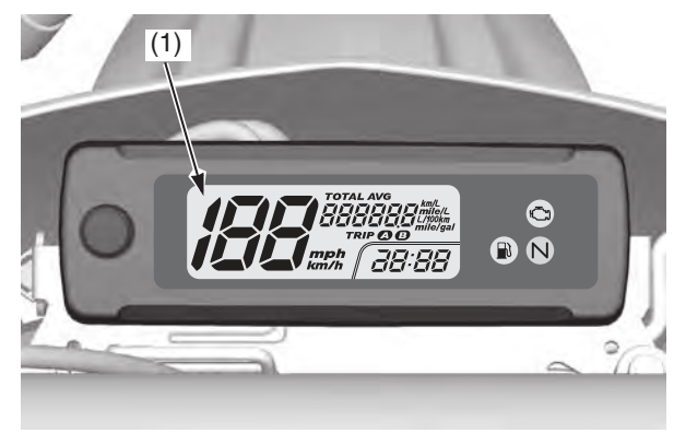
(1) multi-function display

If any part of these displays does not come on when it should, have your dealer check for problems.