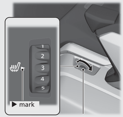
Passenger seat heater switch

The passenger seat heater indicator goes off.