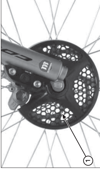
(1) BRAKE DISC

If either pad is worn, both pads must be replaced.