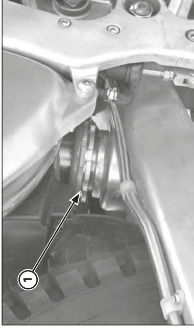
(1) PRE-LOAD ADJUSTER