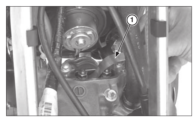
(1) FEELER GAUGE

Make sure the piston is at TDC (Top Dead Center) on the compression stroke by moving the rocker arms.