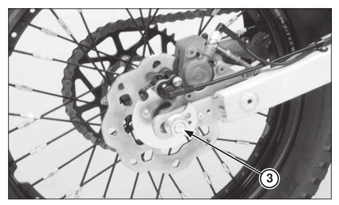
(3) AXLE NUT

Insert the rear axle into the left chain adjuster, side collar and wheel.