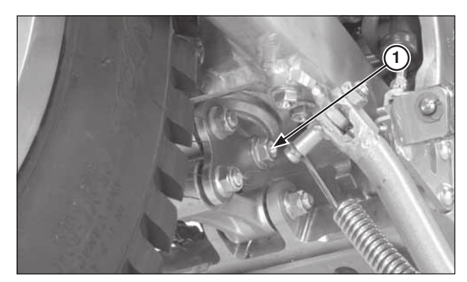
(1) LOWER MOUNTING BOLT/NUT

Set the shock absorber into the frame and install the upper mounting bolt from the left side. Install the nut.