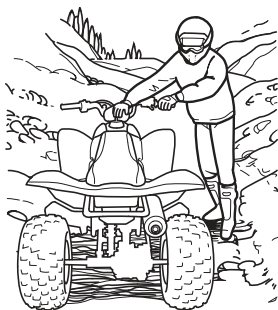
Be sure your legs are clear of the wheels.

If the hill is not too steep and you have good footing, you may be able to walk the ATV back down the hill. Make sure your intended path is clear in case you lose control of the ATV.