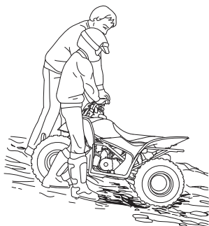
Body position for backing down a hill.