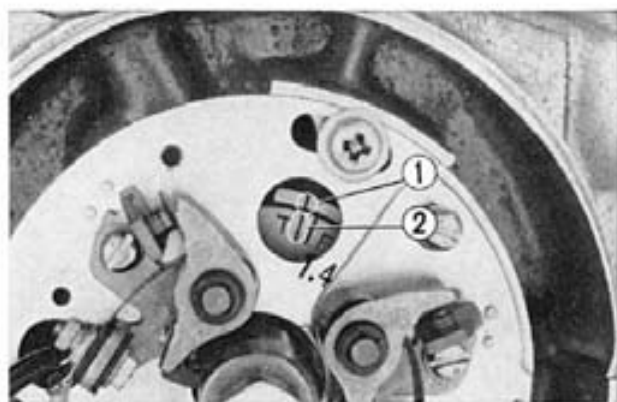
Fig. 3-39 ① Index mark ② "T" mark

a. Position the No. 1 and No. 4 cylinders to the top-dead-center by turning the crankshaft and aligning the No. 1 and No. 4 "T" marks on the spark advancer to the index mark (Fig. 3-39). During this operation, check the movement of the cam chain to make sure that it is properly fitted on the timing sprocket.