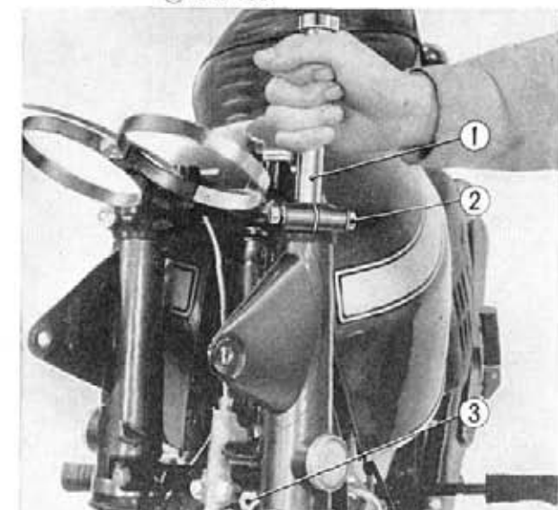
Fig. 11-20 ① Front fork assembling bar ② Front fork pipe setting bolt (8 mm) ③ Front fork pipe setting bolt (10 mm)