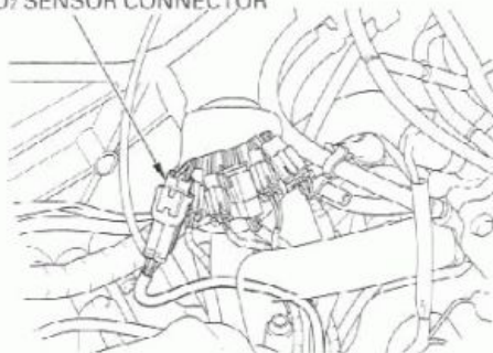
O 2 SENSOR CONNECTOR